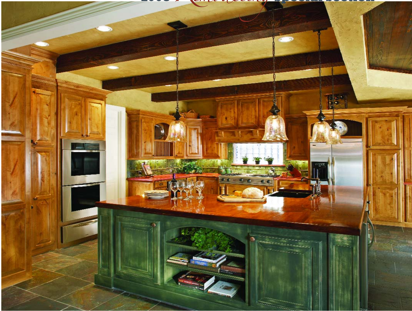
ABOVE: Additional storage was key in the kitchen. The new island with maple top has 16 feet of storage and now features a wine chiller and trash compactor. Slate flooring and Douglas fir beams on the ceiling add to the rustic look. OPPOSITE: Highlights in the breakfast nook include a cypress ceiling and additional storage with an 8-foot-tall glass-front hutch and a built-in cabinet that holds the TV.

By Amanda Flatten